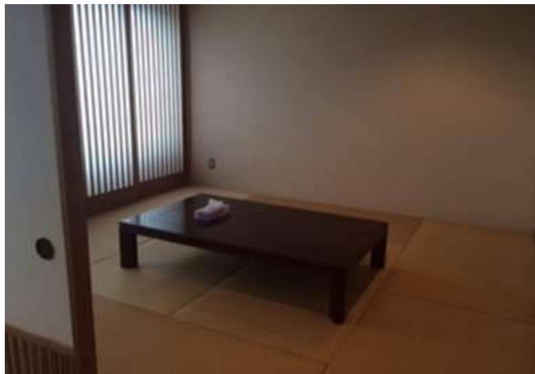
*Head office Japanese style reception room

We feel that most of you have contact with very restricted staff of AMCON. Thus, we would like to launch series of article dedicated to and focusing on your further understanding on AMCON. In this second volume, we would like to introduce you our Overseas Sales Group Manager and Team leader.